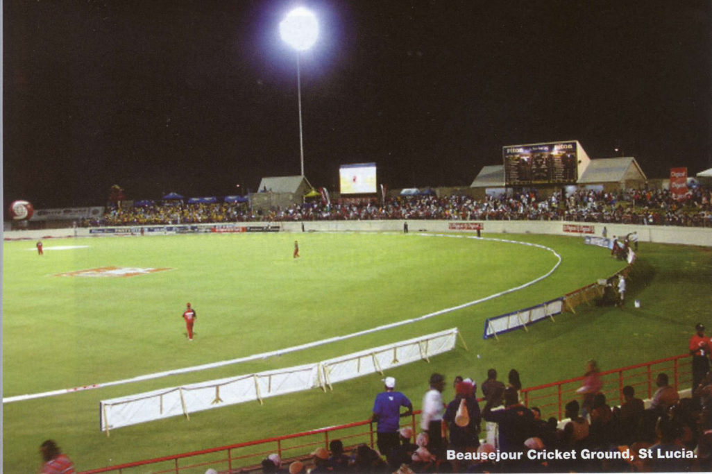
Beausejour Cricket Ground, St Lucia.